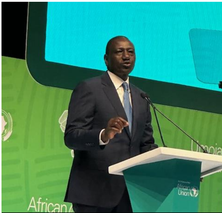
Nairobi Declaration was endorsed in Presence of Kenyan President Dr William Ruto

The Summit brought together more than 30 African Heads of State, high-ranking government officials, senior policy makers, private-sector and civil society organisations. Other participants include representatives of farmer organisations and development agencies, including NGOs, scholars and scientists.