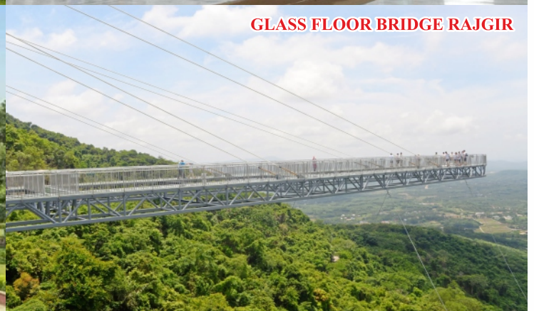
GLASS FLOOR BRIDGE RAJGIR