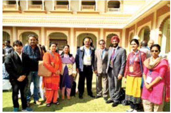
Refreshment time between various sessions of ICDD