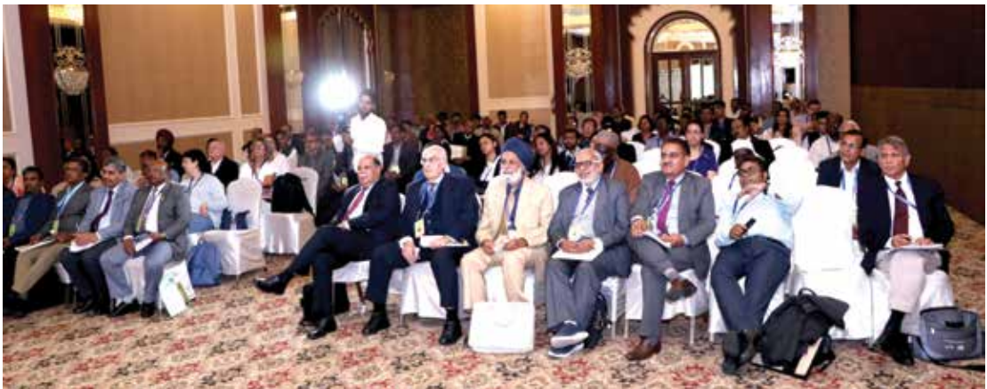
View of participants in the Satellite Symposium