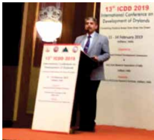
Dr D.K. Yadava

Dr D.K. Yadava , ADG (Seed), Crop Science Division, ICAR, New Delhi, expressed concern about underutilization of germplasm for crop improvement programs. He said that we have not used germplasm efficiently and no systematic efforts are made to identify the donors for abiotic stresses and very few genetic resources identified based on the natural screening conditions. In order to withstand severe climate change, new genetic stocks are required that have high degree of tolerance to high temperatures during sowing as well as the time of maturity. The screening methods also should use modern methodologies like large-scale genotyping for tagging genes and facilities like phenomics and phytotron for proper phenotyping. Like other major crops, oilseed nurseries from the global platform need to be brought to India for efficient use of germplasm. Farmers who