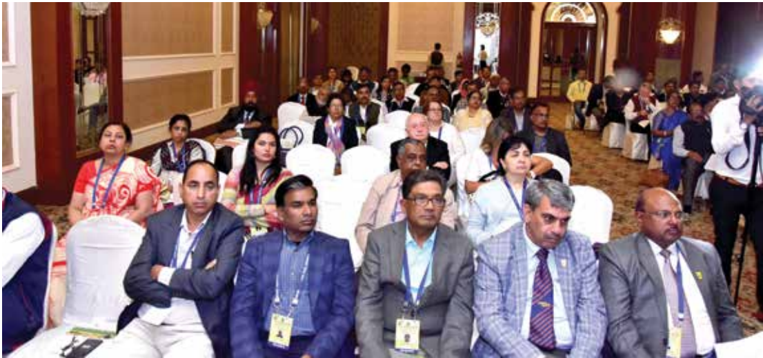
View of the audience