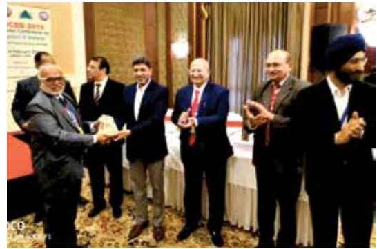
Presentation of Mementoes to Speakers and Panelists of the Satellite Symposium