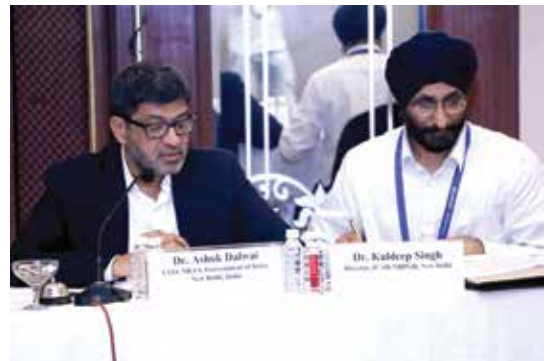
Dignitaries on the dais