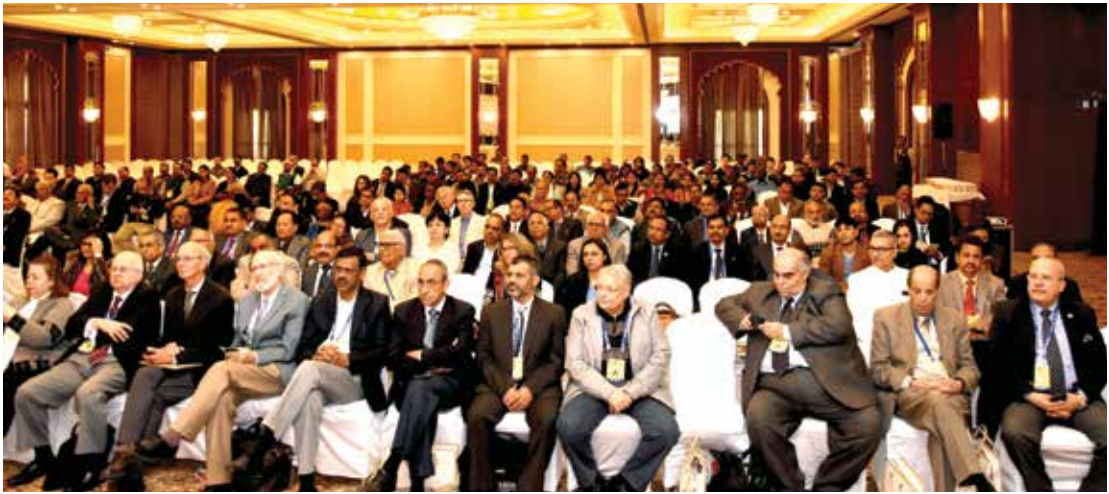
View of the Participants