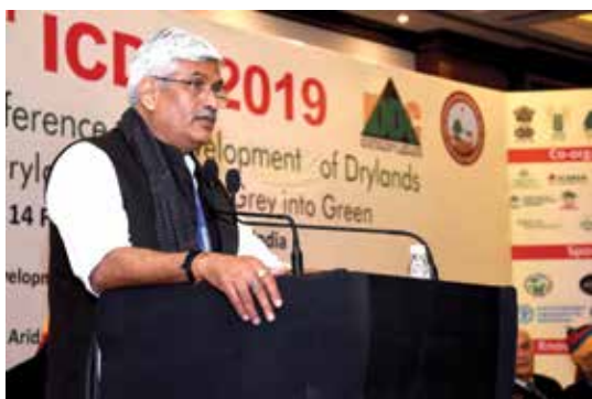
Mr Gajendra Singh Shekhawat, the then Minister of State for Agriculture and Farmers' Welfare, addressing the gathering