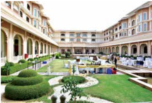
Hotel Indana Palace, Jodhpur