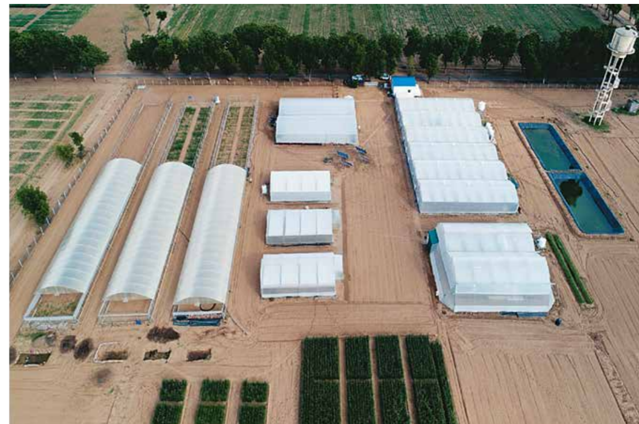
Figure 5. Precision farming