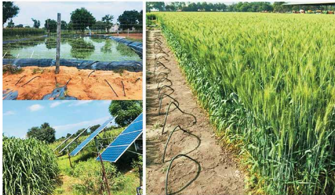
Figure 6. Good agricultural practices for climate-smart agriculture rain water harvest + solar energy + sub-surface fertigation + conservation agriculture