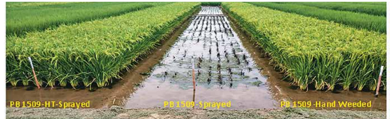
Figure 1. Herbicide tolerant (Ht) direct seeded basmati rice

Thanks to Green Revolution in late sixties, we have been successful in increasing food grain production by six and half-fold (323.5 mt) as against four and half-fold increase in population. From net importing nation, India has emerged as a significant agriculture exporter fetching around US $ 55 billion annually. No doubt, these gains have come at the cost of adverse spill-over effects on natural resources, besides climate change. India also witnessed remarkable achievements in horticulture (341.5 mt), milk production (210 mt), and the fish production (14.2 mt). Also, the country's buffer stock of food grains reached to almost 95 mt by 2020. These impressive gains in agricultural output, productivity, and poverty reduction highlight India's remarkable progress towards food security and improved livelihood for millions of smallholder farmers. The cradles of success of different revolutions (green, white, blue, rainbow) include political