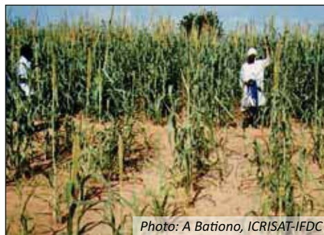
Microdosing (left) multiplies millet yields (right rear) on sandy Sahelian soils.

Our research had informed us that smallholder fields are usually nutrient-deficient, so that even a small amount of fertilizer would generate a large and profitable response from the crop. Research found that even applying just one-sixth of the recommended rate of fertilizer resulted in 50-100% yield increases. We studied the physiology and economics of this microdosing system using crop models and they indicated that, contrary to conventional wisdom, low rates of fertilizer are not overly risky. With low rates, crops don't become too leafy and run out of water before maturity. On the contrary, these low rates of fertilizer cause plant roots to grow faster and more extensively, and make the plants more drought-hardy.